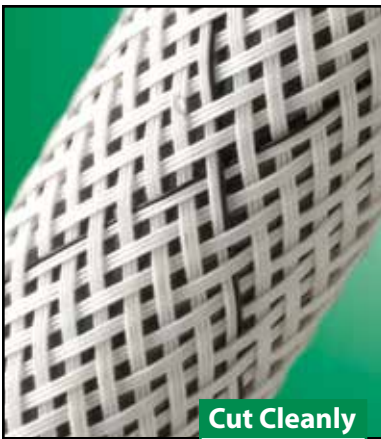
Cut Cleanly Hot Knife