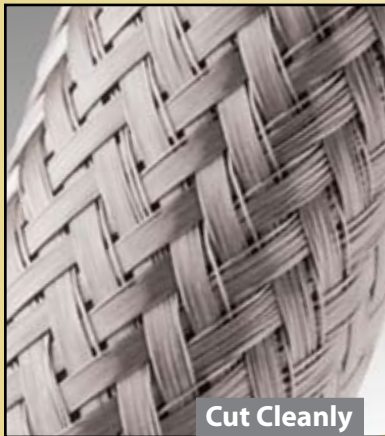
Cut Cleanly Shears