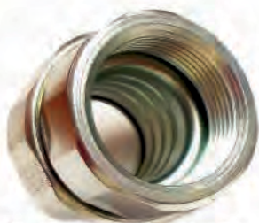
Rigid Threaded to Liquid Tight Conduit

Available: Alloy Steel Construction Zinc Plated, Galvanized Plating Option Available*