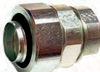
Rigid Compression to Liquid Tight Conduit

Our Liquid Tight Fittings Are the Finest Made