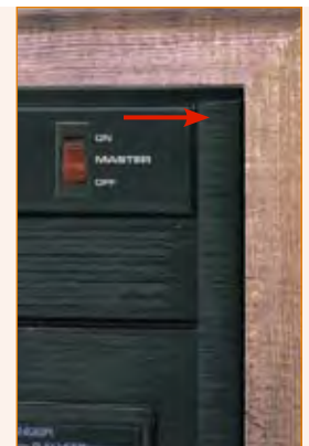
with trim strip installed