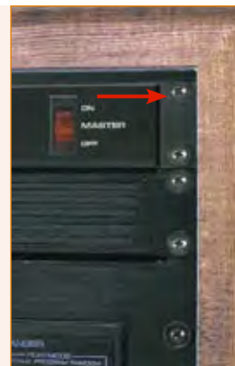
without trim strip installed