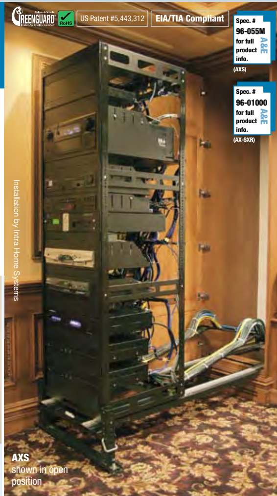
AXS shown in open position