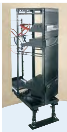
AX-SXR rotating slide out rack