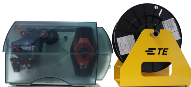
TE3112 with Universal reel holder