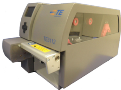
TE3112 fitted with, metal cover and Cutter/perforator