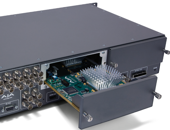
Corvid Ultra - rear panel Shown with TruScale™ card installed