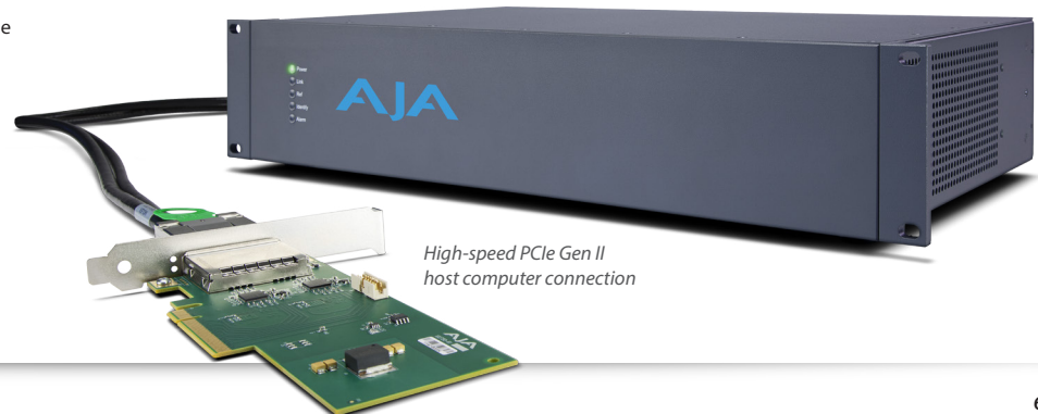
High-speed PCIe Gen II host computer connection

HDMI output HDMI 2.0b output capable of HD and 4K display.