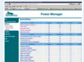
Power Manager Software

Try the UPS Runtime Calculator at www.middleatlantic.com!