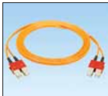
SC to SC Patch Cord