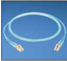
LC to LC Patch Cord