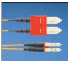
SC to LC Patch Cord