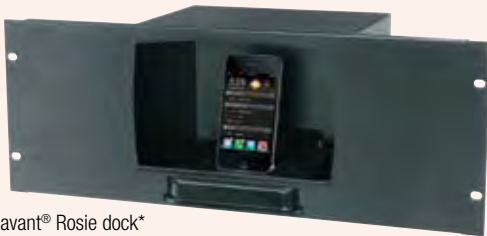
RSH4A4-MS custom made for Savant® Rosie dock*