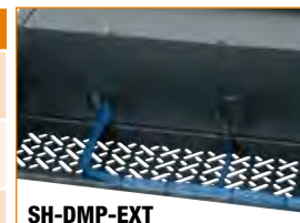
SH-DMP-EXT rear accessory includes cable management tie points