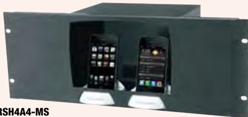
RSH4A4-MS custom made for 2 Crestron® docks*