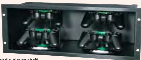
SH-DMP-A digital media player shelf shown with game controllers*