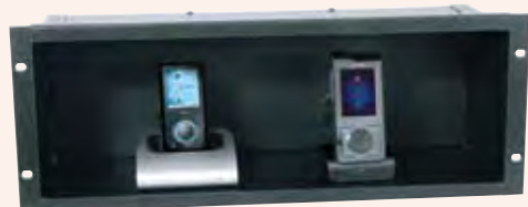
SH-DMP-S shown with MP3 player and satellite radio receiver*