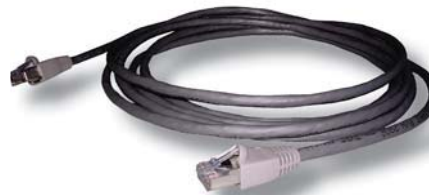
Shielded RJ45/45 4 Pair Stranded PVC Grey With Boots