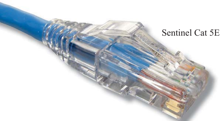
Sentinel Cat 5E