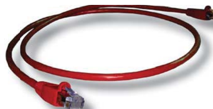
RJ45/45 4 Pair Stranded PVC Red With Boots