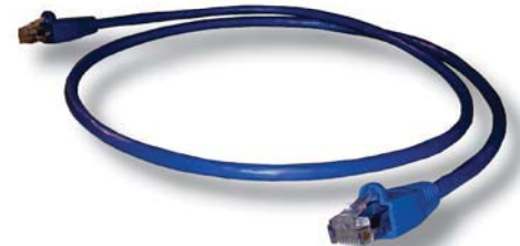
RJ45/45 4 Pair Stranded PVC Blue With Boots