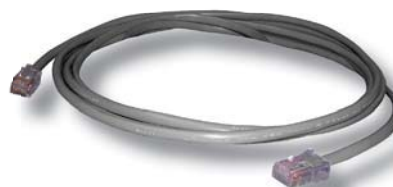
RJ45/45 4 Pair Solid PVC Grey