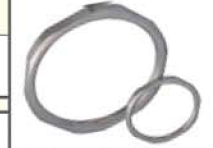
Optional Locking Nuts & Other Accessories starting on Page 28 - 39.