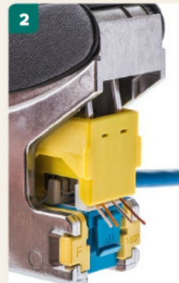
Punch & Cut